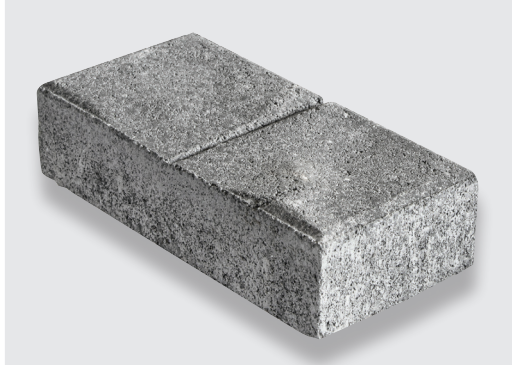
London StonePave 50mm

3 years on it is a testament to the oxides Bowers use as the colour looks the same.